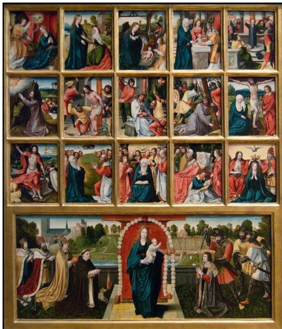
The Fifteen Mysteries of the Rosary and Our Lady of the Rosary